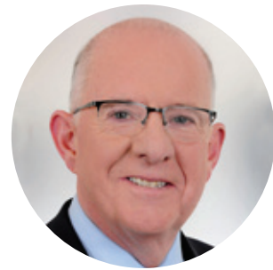
Charlie Flanagan, T.D, Minister for Foreign Affairs

“The launch of the Online Passport Application Service, developed by ActionPoint, is one of the most significant innovations in customer service that this Department has delivered over the past fifteen years.”